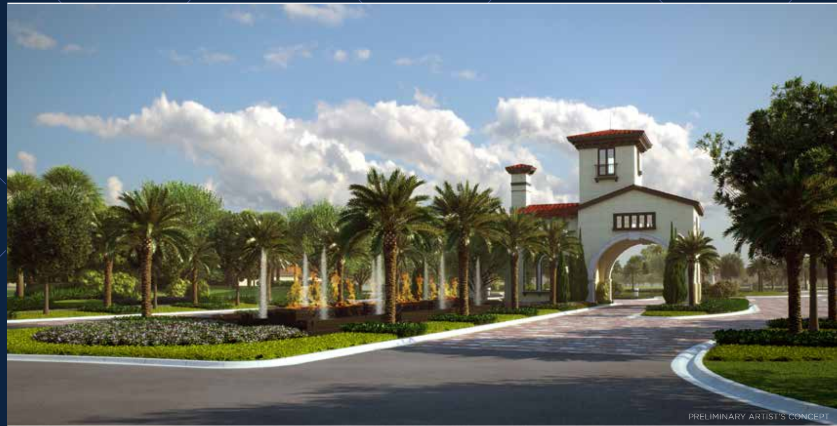
PRELIMINARY ARTIST'S CONCEPT